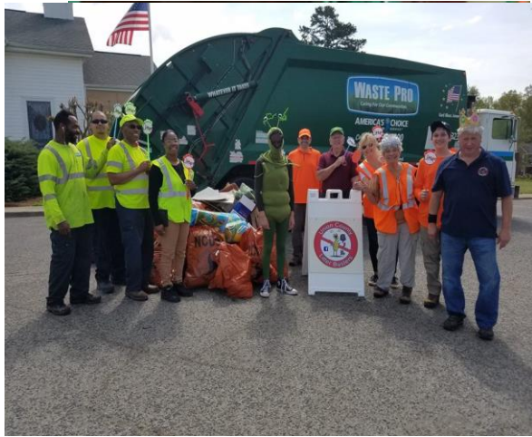
Litter Busters, community volunteers and Waste Pro team members during a recent Litter Sweep.